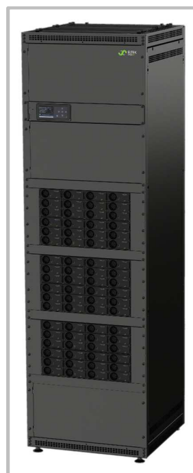
72 rectifiers power cabinet