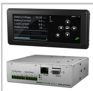
Smartpack2 system controller